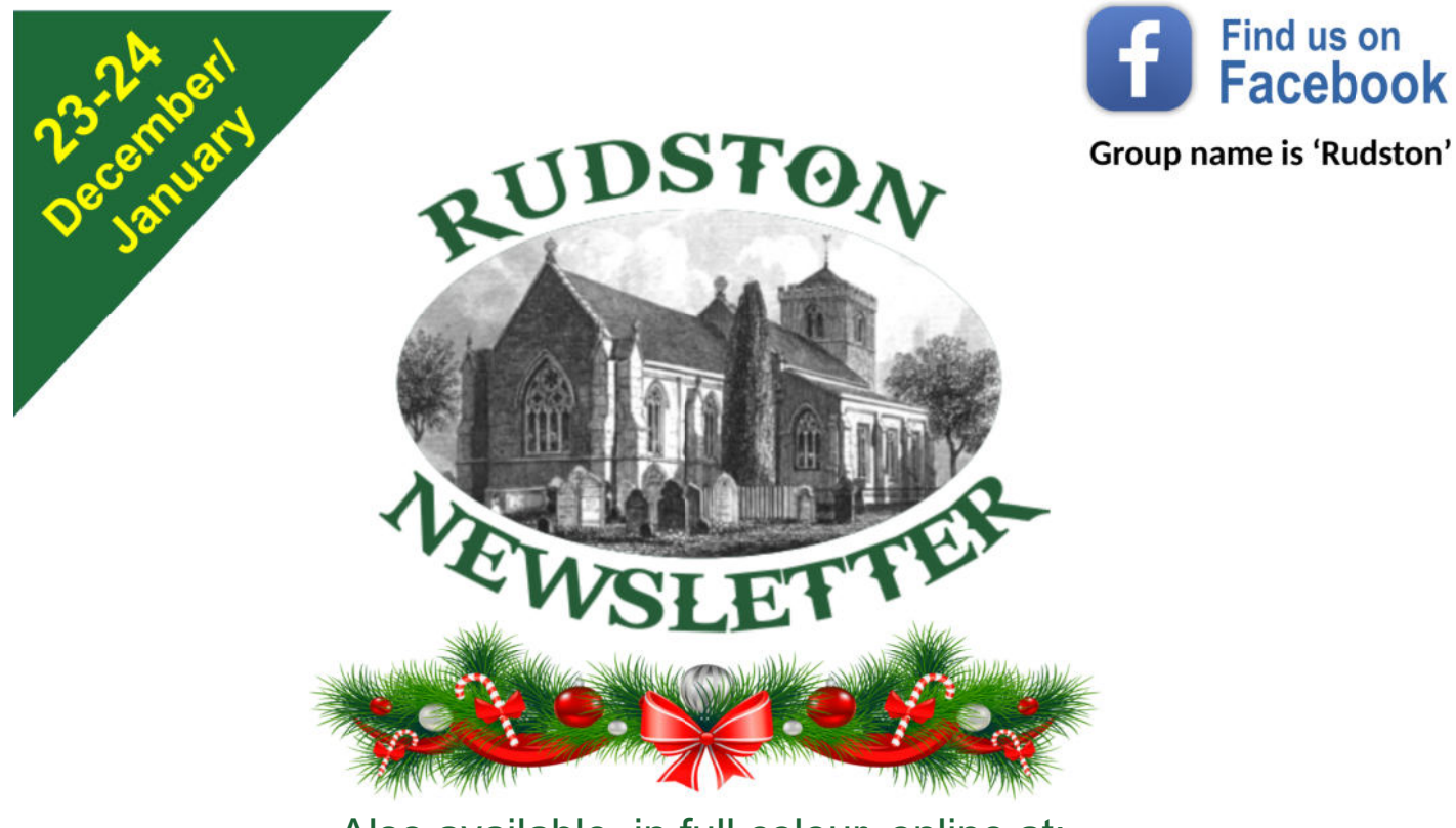
Also available, in full colour, online at:www.rudston.org.uk/newsletter